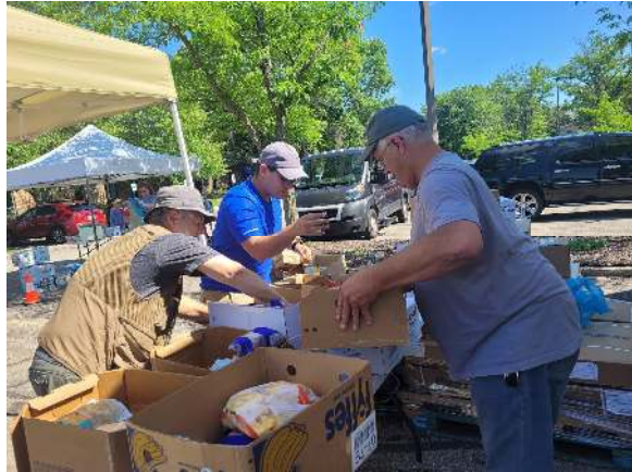
Preparing boxes of frozen meat