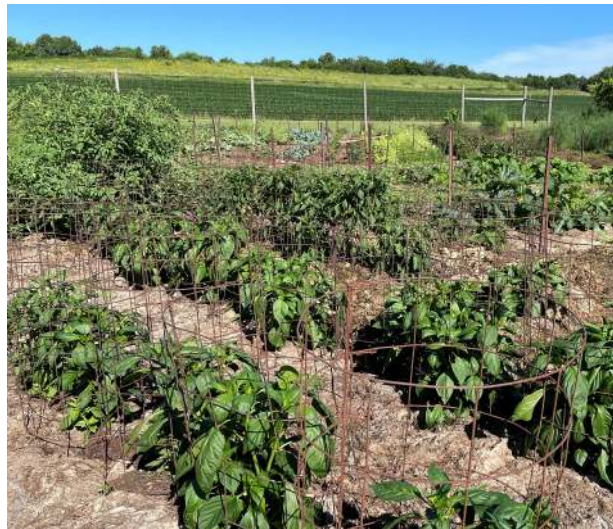
Well-mulched Pepper Plants!

Do you like to garden too? Contact us about how you can help!