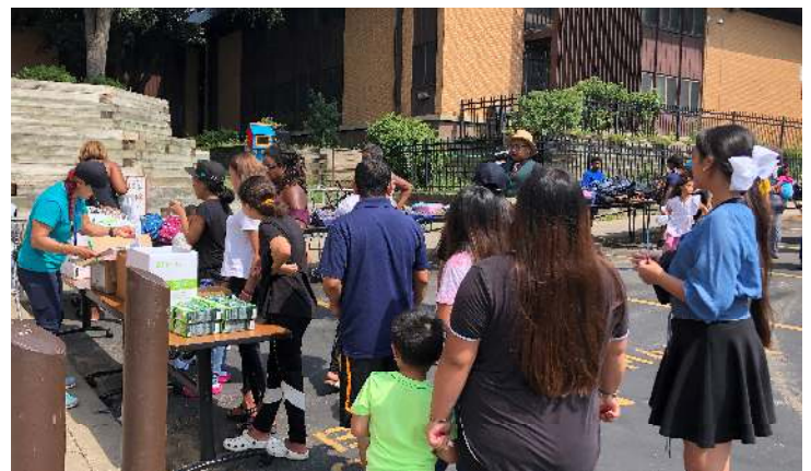
Kids lined up to get their school supplies!