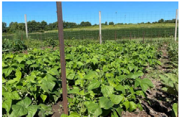
Lots of yummy Green Beans!