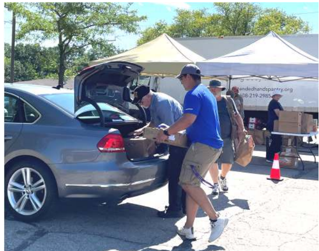
Volunteers loading groceries